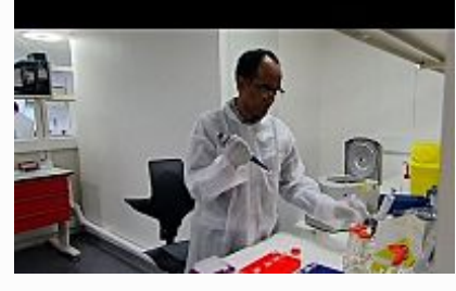
Cancer Patients: New Treatment Strategy is Stunning Doctors