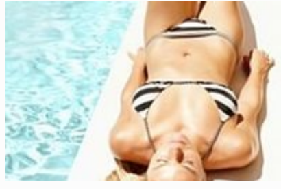
How Covering Up Your Grays Could Impact Your Cancer Risks! Health Central