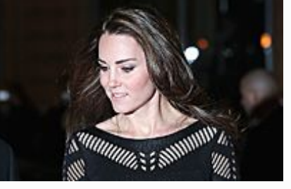
Kate Middleton Wows in a Temperley London Cocktail Dress InStyle